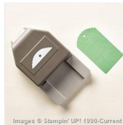
Ornate Tag Topper Punch