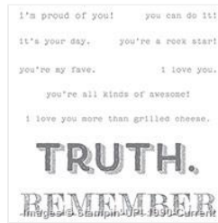
Words Of Truth Clear-Mount Stamp Set