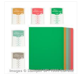
2015-2017 In Color 8-1/2" X 11" Cardstock & Classic Stampin' Pads Kit