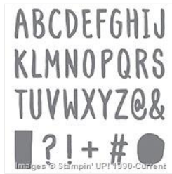
Layered Letters Alphabet Photopolymer Stamp