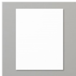
Whisper White 8- 1/2" X 11" Cardstock