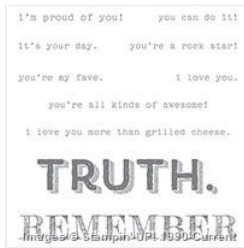
Words Of Truth Wood-Mount Stamp Set