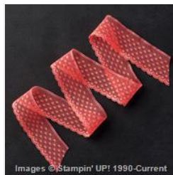
Watermelon Wonder 1" Dotted Lace Trim