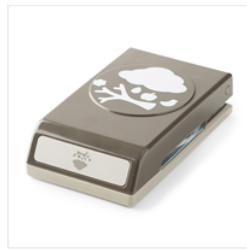
Tree Builder Punch