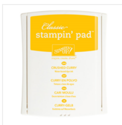
Crushed Curry Classic Stampin' Pad