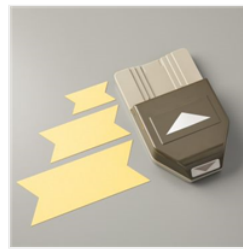
Triple Banner Punch