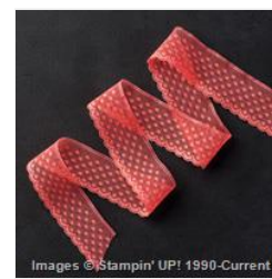
Watermelon Wonder 1" Dotted Lace Trim