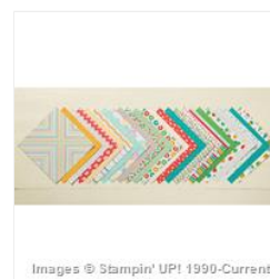
Cherry On Top Designer Series Paper Stack