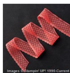
Watermelon Wonder 1" Dotted Lace Trim