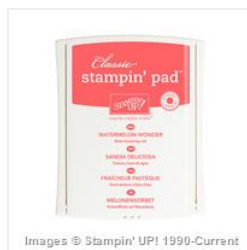
Watermelon Wonder Classic Stampin' Pad