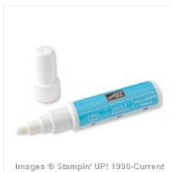
2-Way Glue Pen