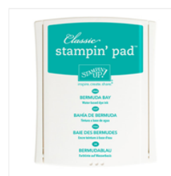
Bermuda Bay Classic Stampin' Pad