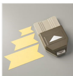
Triple Banner Punch