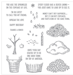
Sprinkles Of Life Photopolymer Stamp Set