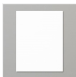
Whisper White 8- 1/2" X 11" Cardstock