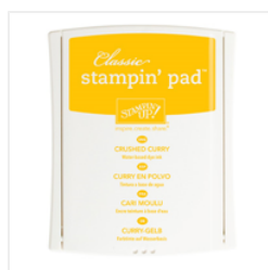
Crushed Curry Classic Stampin' Pad