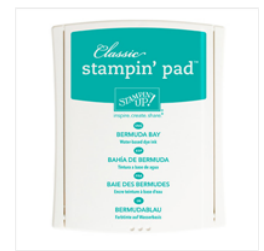
Bermuda Bay Classic Stampin' Pad