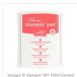
Watermelon Wonder Classic Stampin' Pad