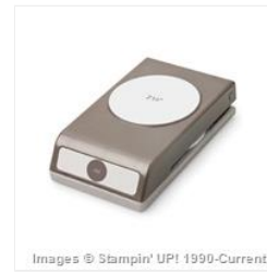
2-1/2" Circle Punch