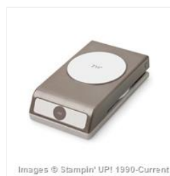
2-1/2" Circle Punch