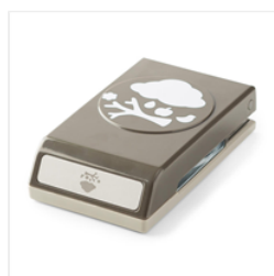
Tree Builder Punch