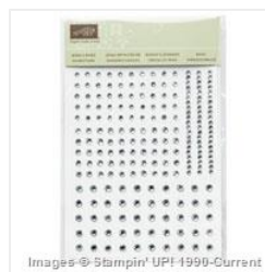
Rhinestone Basic Jewels