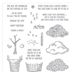
Sprinkles Of Life Photopolymer Stamp Set