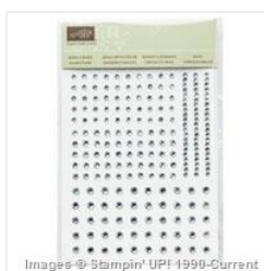
Rhinestone Basic Jewels