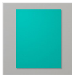
Bermuda Bay 8- 1/2" X 11" Cardstock