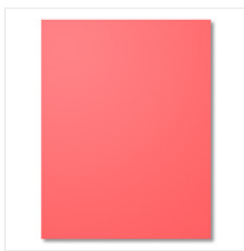
Watermelon Wonder 8-1/2" X 11" Cardstock