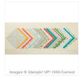
Cherry On Top Designer Series Paper Stack