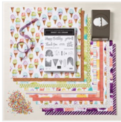
Ice Cream Corner Suite Collection (English) - 155984