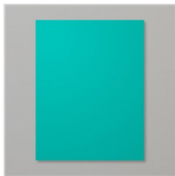
Bermuda Bay 8-1/2" X 11" Cardstock - 131197