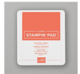
Calypso Coral Classic Stampin' Pad - 147101