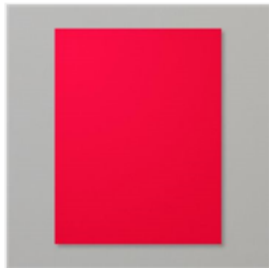
Poppy Parade 8-1/2" X 11" Cardstock - 119793