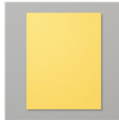
Daffodil Delight 8-1/2" X 11" Cardstock - 119683