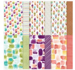
Ice Cream Corner Designer Series Paper - 154567