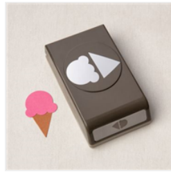
Ice Cream Cone Builder Punch - 154241