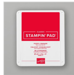
Poppy Parade Classic Stampin' Pad - 147050