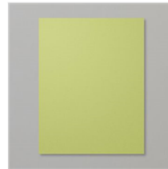
Pear Pizzazz 8-1/2" X 11" Cardstock - 131201