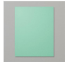
Coastal Cabana 8-1/2" X 11" Cardstock - 131297