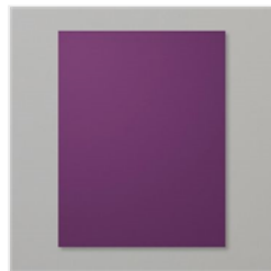
Blackberry Bliss 8-1/2" X 11" Cardstock - 133675