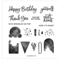
Sweet Ice Cream Photopolymer Stamp Set - 154456