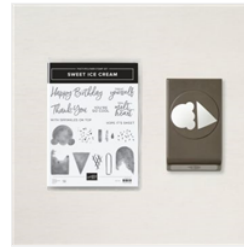
Sweet Ice Cream Bundle (English) - 156244