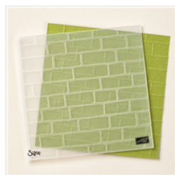
Brick Wall Textured Impressions Embossing Folder - 138288