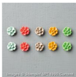
2015-2017 In Color Blossom Accents - 138383