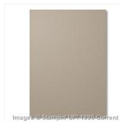
Tip Top Taupe A4 Cardstock - 138343