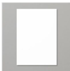
Whisper White A4 Cardstock - 106549