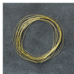
Gold Metallic Thread - 138401