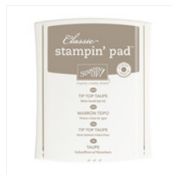
Tip Top Taupe Classic Stampin' Pad - 138325