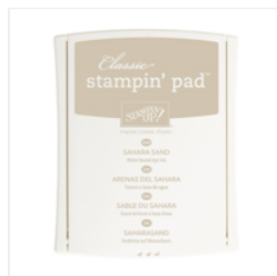
Sahara Sand Classic Stampin' Pad - 126976