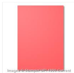
Watermelon Wonder A4 Cardstock - 138341