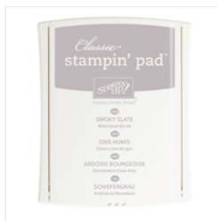
Smoky Slate Classic Stampin' Pad - 131179