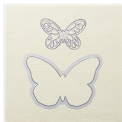
Bold Butterfly Framelits Dies - 138135