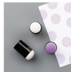
Sponge Daubers - 133773