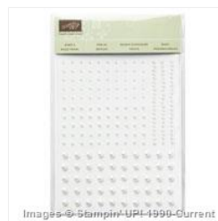
Pearl Basic Jewels - 119247