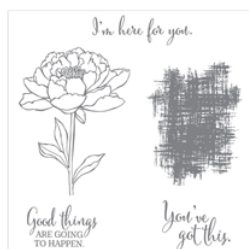
You've Got This Wood-Mount Stamp Set - 139572

http://donnas-stampswellwithothers.blogspot.com/