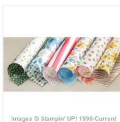
English Garden Designer Series Paper - 138440