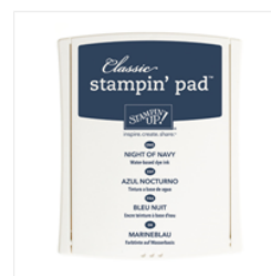
Night Of Navy Classic Stampin' Pad - 126970