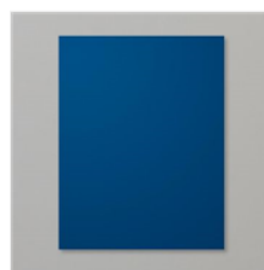
Night Of Navy 8- 1/2" X 11" Cardstock - 100867