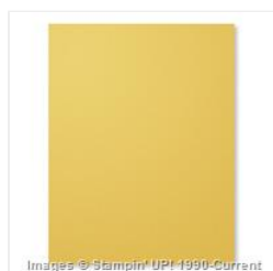
Hello Honey 8-1/2" X 11" Cardstock - 133678