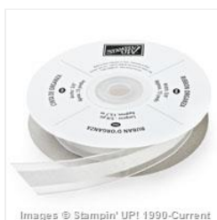
Whisper White 5/8" (1.6 Cm) Organza Ribbon - 114319