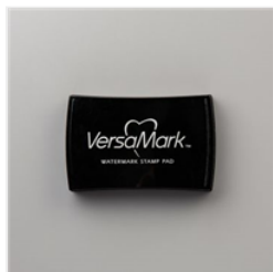
Versamark Pad - 102283