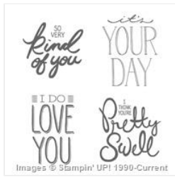
Big On You Photopolymer Stamp Set - 137151