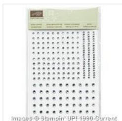
Rhinstone Basic Jewels - 119246