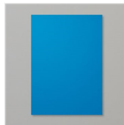
Pacific Point A4 Cardstock - 116202