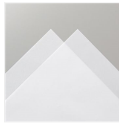
Vellum A4 Cardstock - 106584