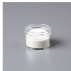
Clear Stampin' Emboss Powder - 109130