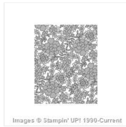
Something Lacy Clear Stamp - 138900