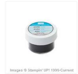
Black Stampin' Emboss Powder - 109133