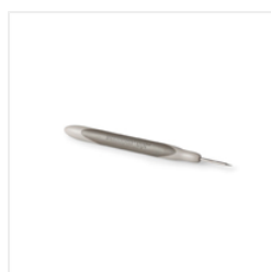
Paper-Piercing Tool - 126189