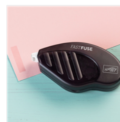
Fast Fuse Adhesive - 129026