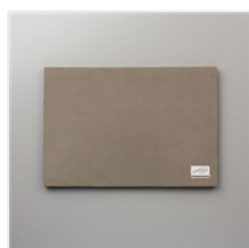
Stampin' Pierce Mat - 126199