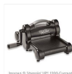
Big Shot - 113439