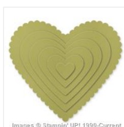
Hearts Collection Framelits Die - 125599