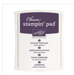
Elegant Eggplant Classic Stampin' Pad - 126969