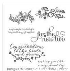
For The New Two Clear-Mount Stamp Set - 138562