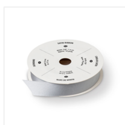
Silver 5/8" (1.6 Cm) Satin Ribbon - 134548