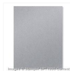
Brushed Silver 8- 1/2" X 11" Card Stock - 100712