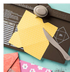
Envelope Punch Board - 133774