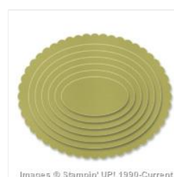
Ovals Collection Framelits Dies - 129381