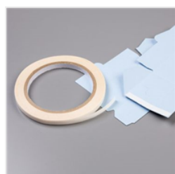
Tear & Tape Adhesive - 138995