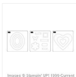
Occasions Paper- Piercing Pack - 129387