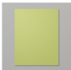
Pear Pizzazz 8- 1/2" X 11" Cardstock - 131201