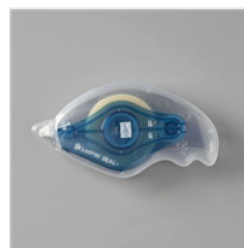
Stampin' Seal+ - 149699