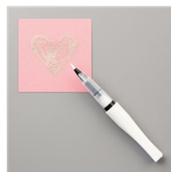
Wink Of Stella Clear Glitter Brush - 141897