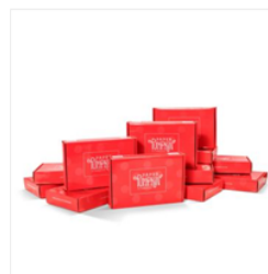
Prepaid Paper Pumpkin Subscription 12- Month - 137861