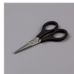
Paper Snips Scissors - 103579