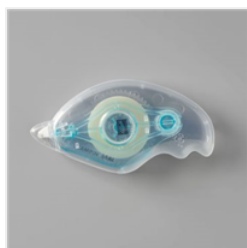
Stampin' Seal - 152813