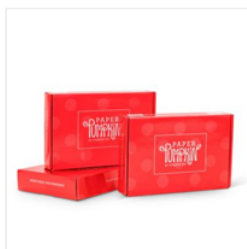
Prepaid Paper Pumpkin Subscription 3- Month - 137859