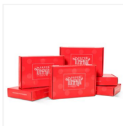
Prepaid Paper Pumpkin Subscription 6- Month - 137860