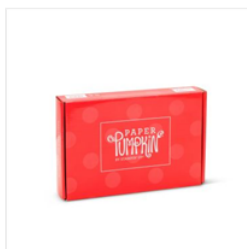
Prepaid Paper Pumpkin Subscription 1- Month - 137858