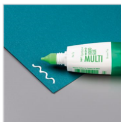
Multipurpose Liquid Glue - 110755