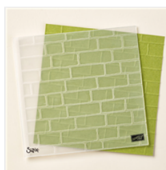
Brick Wall Textured Impressions Embossing Folder - 138288