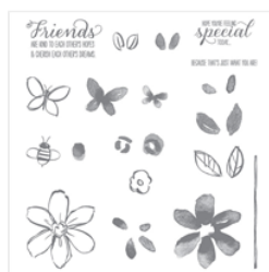
Garden In Bloom Photopolymer Stamp Set - 139433