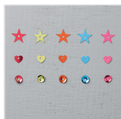
Brights Sequin Assortment - 138389