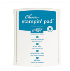
Island Indigo Classic Stampin' Pad - 126986