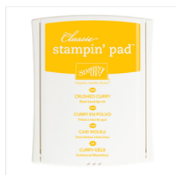
Crushed Curry Classic Stampin' Pad - 131173