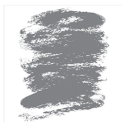
Watercolor Wash Clear-Mount Background Stamp - 139538