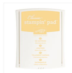
So Saffron Classic Stampin' Pad - 126957