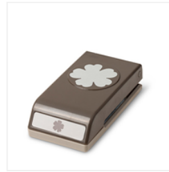
Pansy Punch - 130698