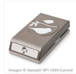
Bird Builder Punch - 117191